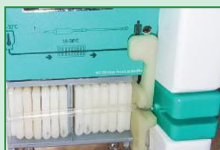
Free Flow Protection