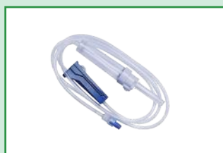
Any IV Set

An infusion pump that serves both volumetric & drop counting function