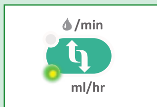
Drop/min & ml/hr